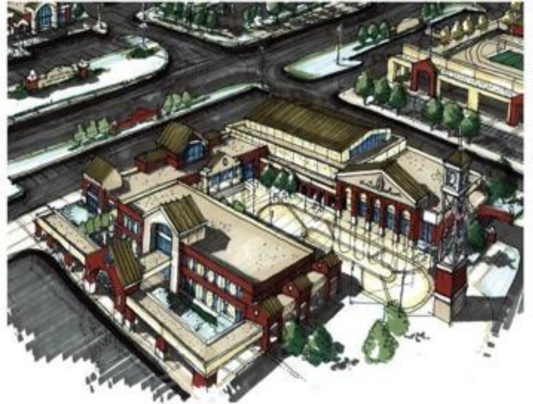
9TH GRADE ACADEMY